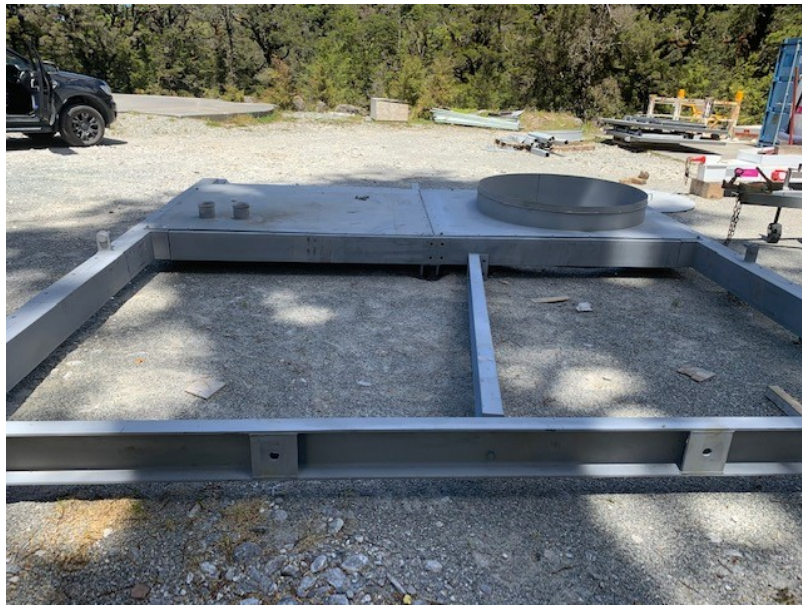
The VCD2 being prepared for installation at the mine site.