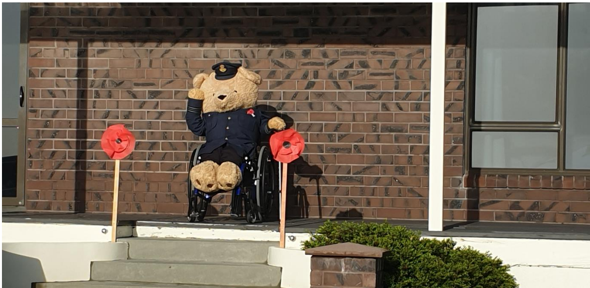
Photographed on Waterwalk Road, Greymouth

Hill 60 was the site of a number of unsuccessful attacks by units of the New Zealand Mounted Rifles Brigade in August 1915.