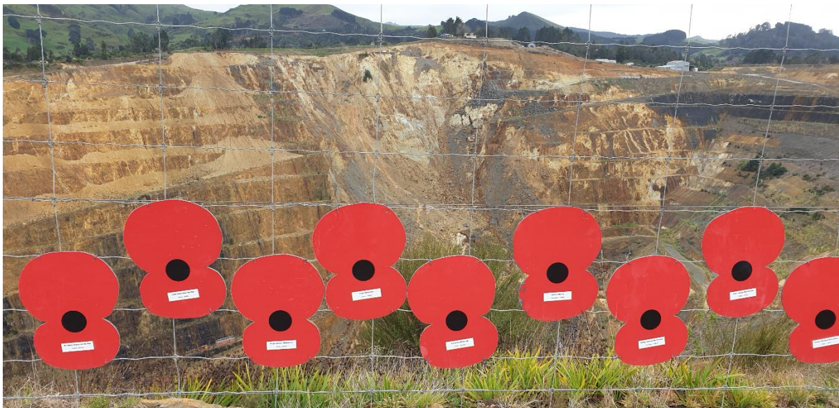
Photo - Poppies beside the Waihi Gold Mine, Coromandel