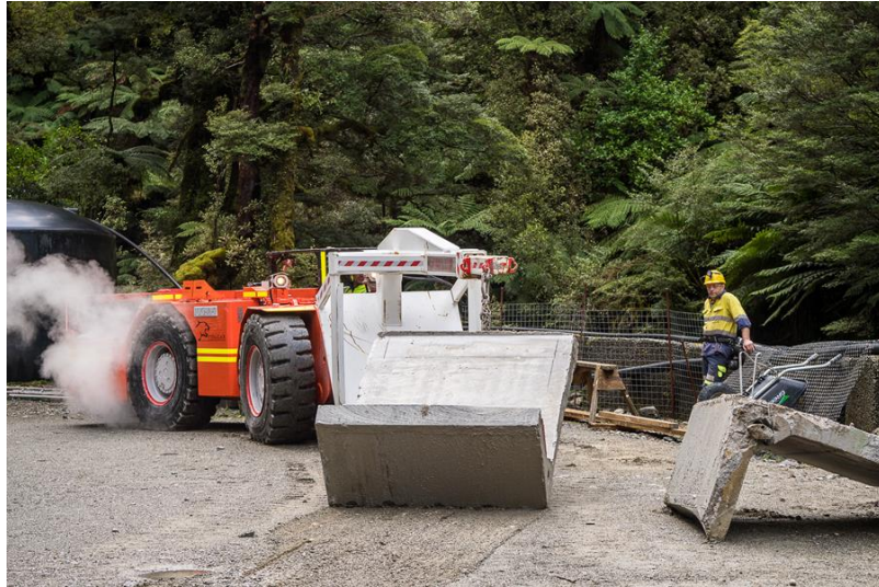
The jugonaut loader hauling large pieces of the 30m barrier out of the mine.

TE KĀHUI WHAKAMANA RUA TEKAU MĀ IWA PIKE RIVER RECOVERY AGENCY