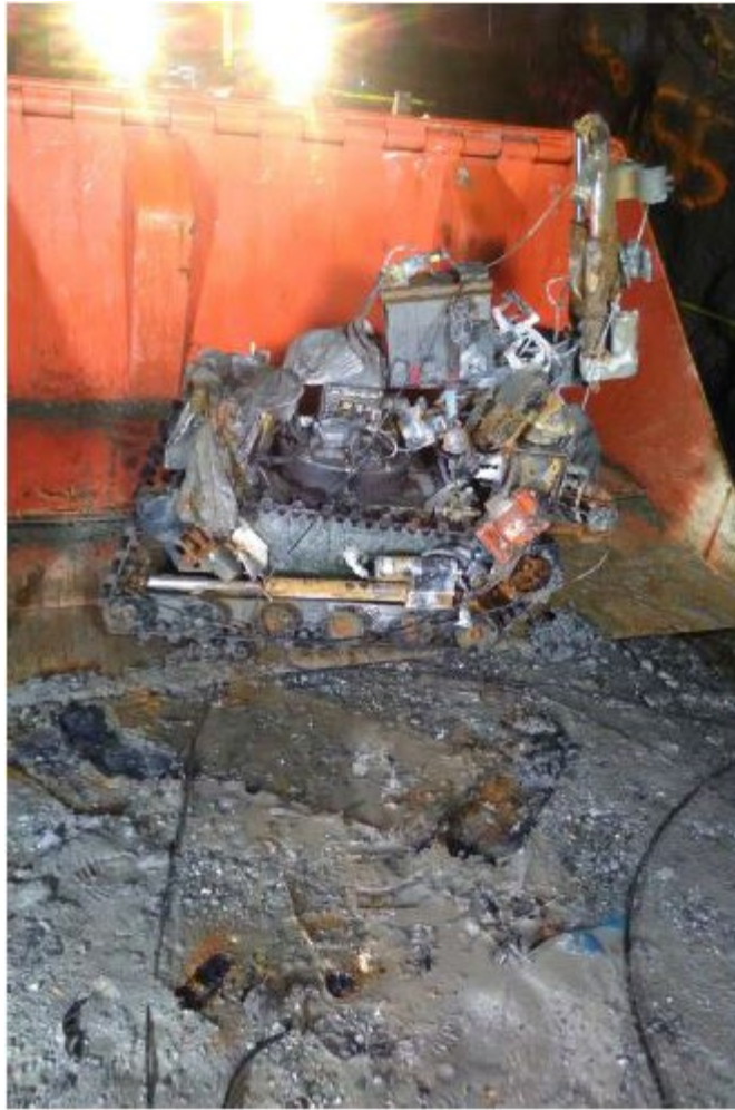
A loader scoops up the robot to remove it from the drift.