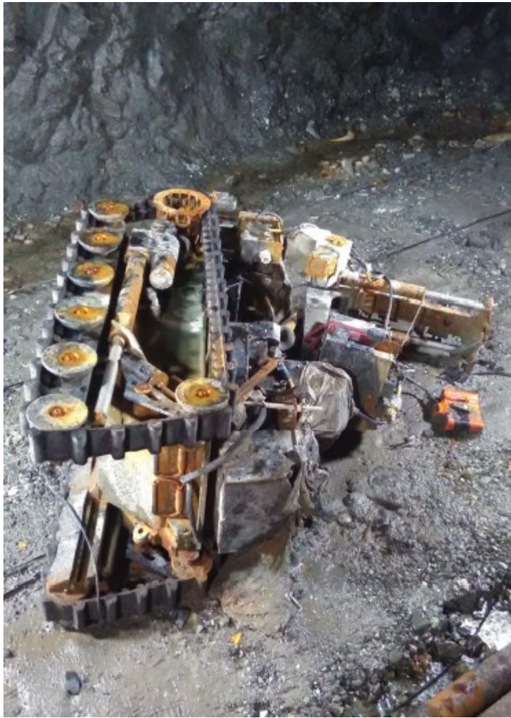
A military robot was recovered on Wednesday 10 June, 759m up the Pike River Mine drift.