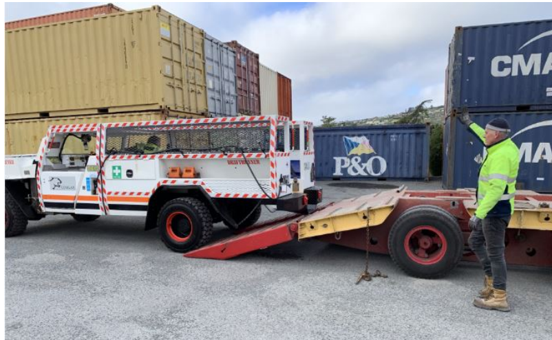
The new driftrunner was recently loaded in Christchurch for transportation to the site.

loader by the end of July, all going to plan.